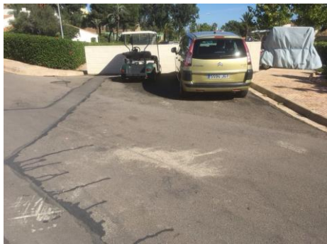
Top of long stay car park, new blue parking space. Also leaves space for a golf buggy.