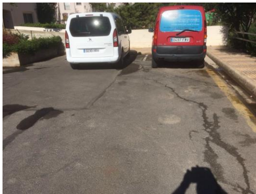
Next to new planter at block 2 new blue parking space and drop kerb. Possible golf buggy spaces to left.

opposite new blue parking space, drop kerb