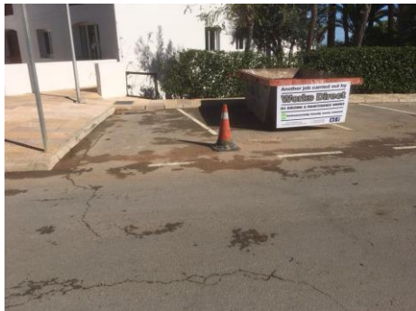
End of 14 new blue parking space and drop kerb.