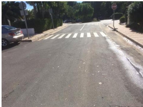
Crossing from 13 to 18 drop down kerbs.