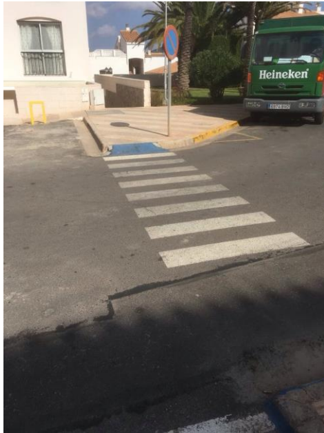
Ramp up from Plaza Chica, drop down kerb.